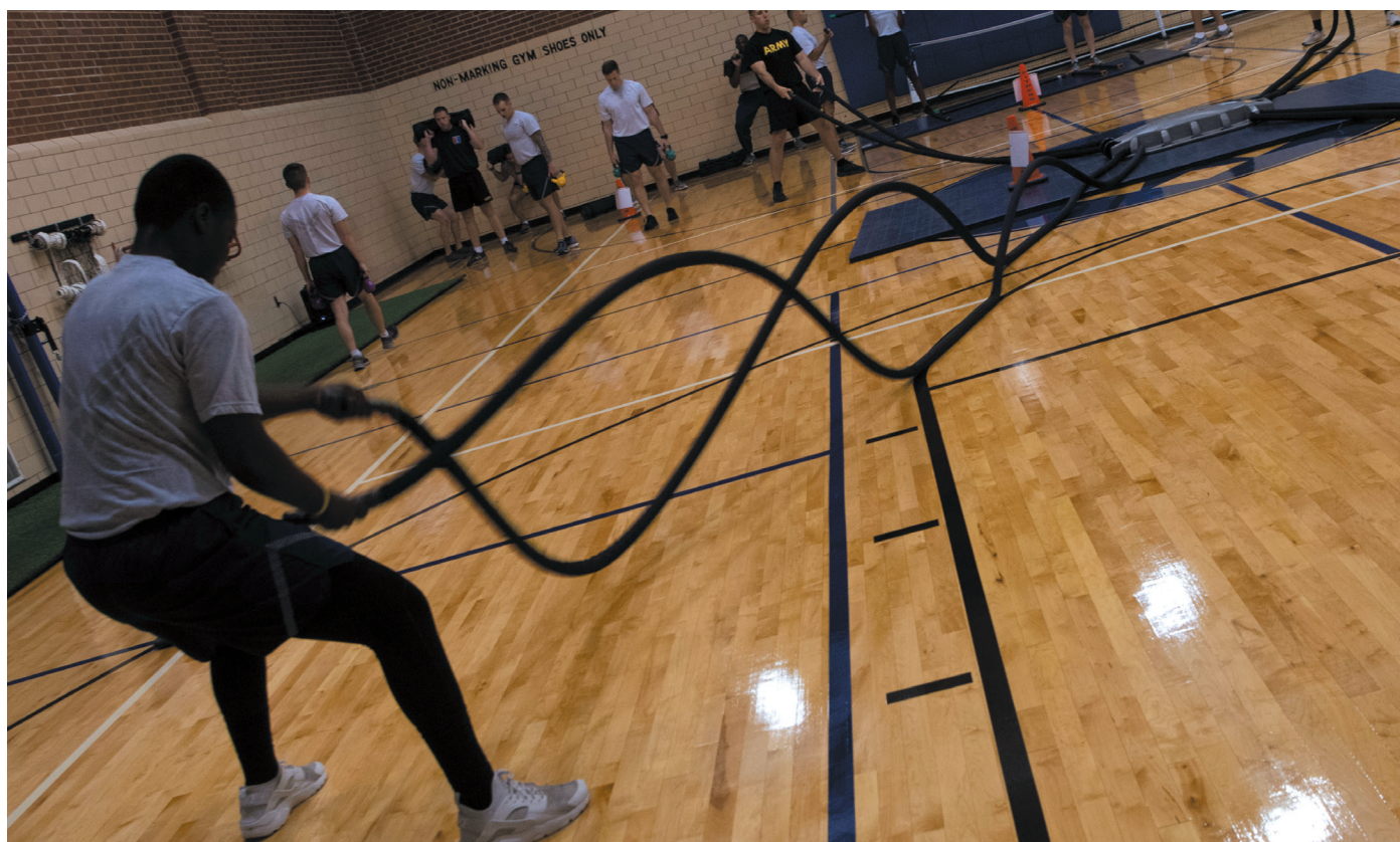
DOO PHOTO BY LISA FERNANDEZ

The Wright-Patterson Air Force Base exchange wants to be your first choice for shopping. It offers a price-match program that guarantees the lowest prices in town. Hours for services outside the main exchange vary, so call or visit the website for detailed information.