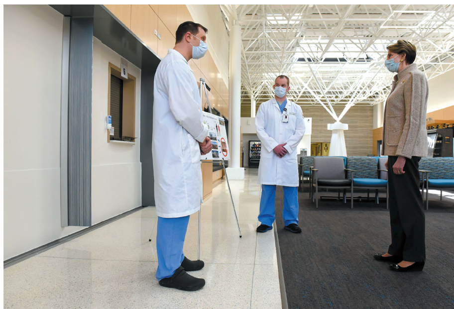
U.S. AIR FORCE PHOTO BY TY GREENLEES

The 88th Medical Group is one of the largest Air Force military treatment facilities, providing primary and specialty care to more than 62,000 eligible beneficiaries. The group is a major military and civilian integrated platform with many