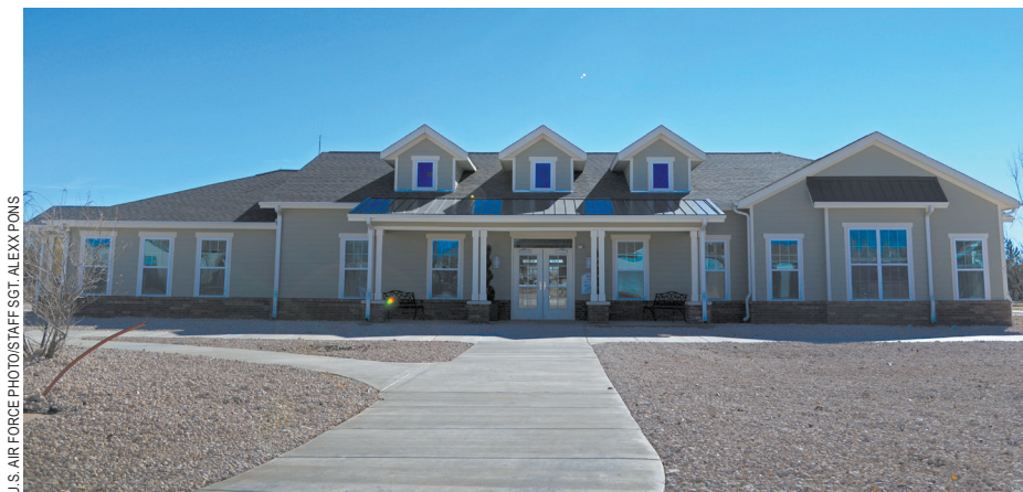
U.S. AIR FORCE PHOTO/STAFF SGT. ALEX PONS